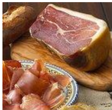
Spain Dish: Serrano Ham