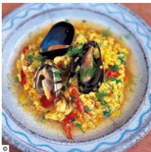
Italian Dish: Risotto with sea-food