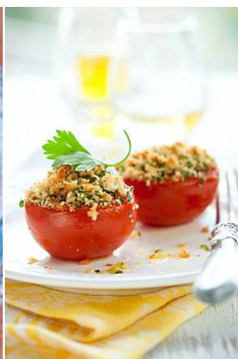
French Dishes: Tomates farcies and ratatouille (from Provence)